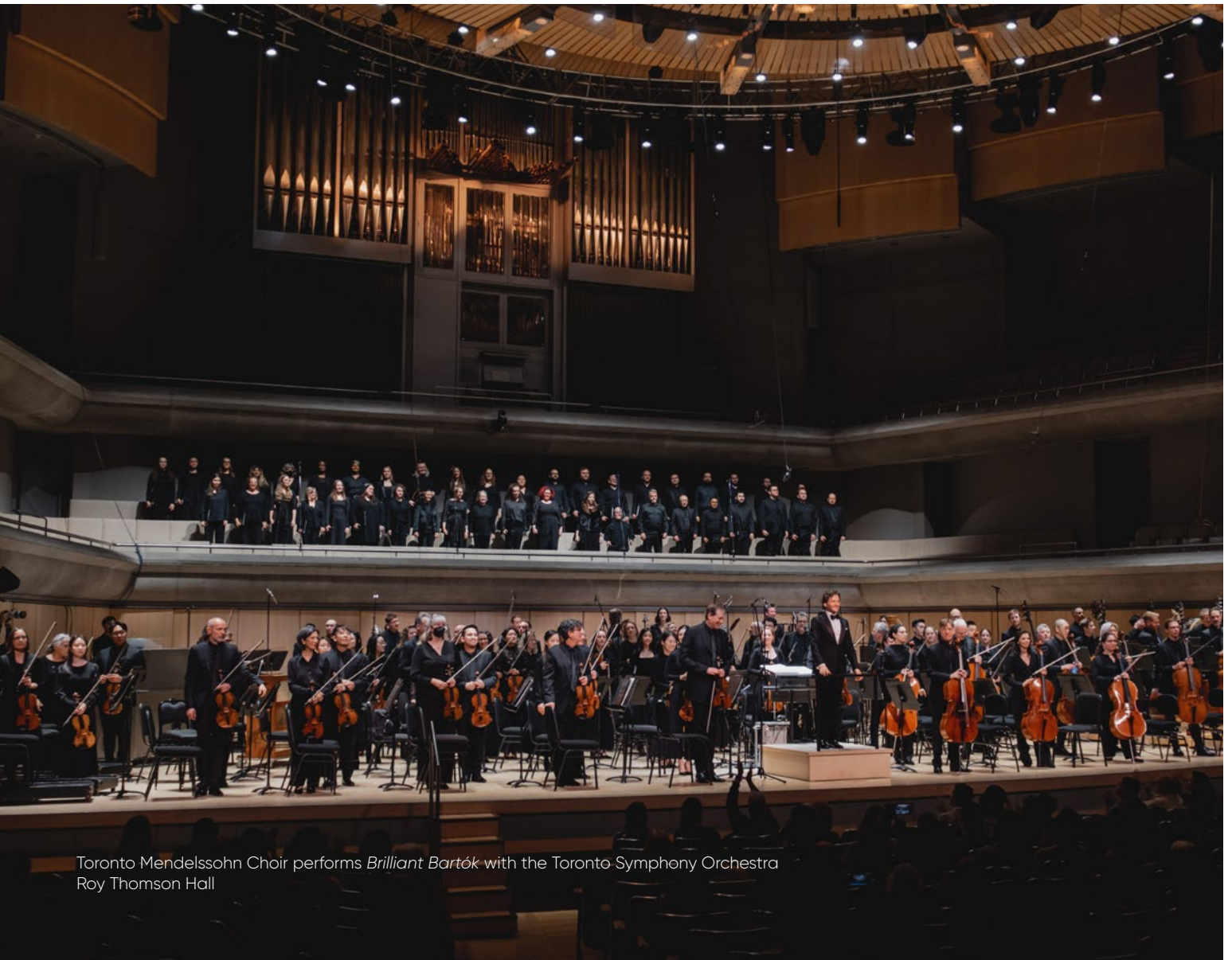
Toronto Mendelssohn Choir performs Brilliant Bartók with the Toronto Symphony Orchestra Roy Thomson Hall