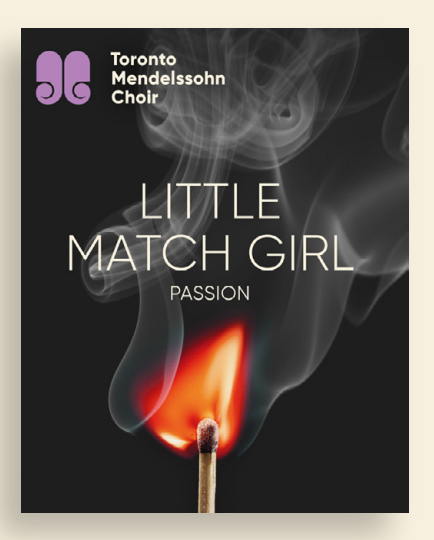
March 18, 2023 Church of the Holy Trinity Bay & Dundas

December 6 & 7, 2022 Yorkminster Baptist Church Yonge & St. Clair